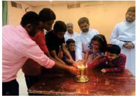
Activity Inaugural function of Yuvajana Sakhyam 2019-2020