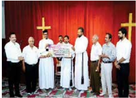
Release of the 2019 Harvest Festival Raffle Coupon